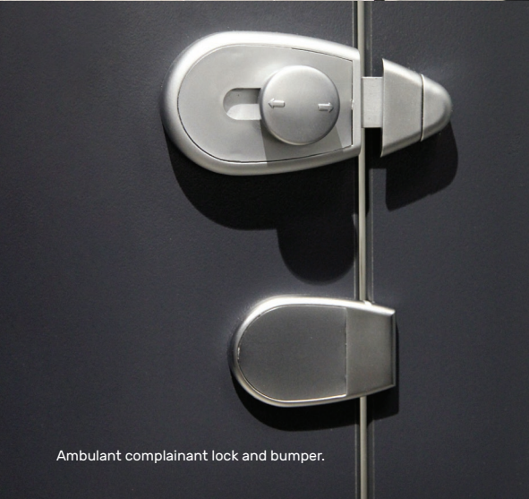
Ambulant complainant lock and bumper.