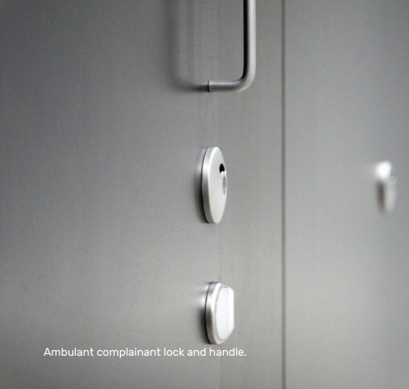
Ambulant compliant lock and handle.