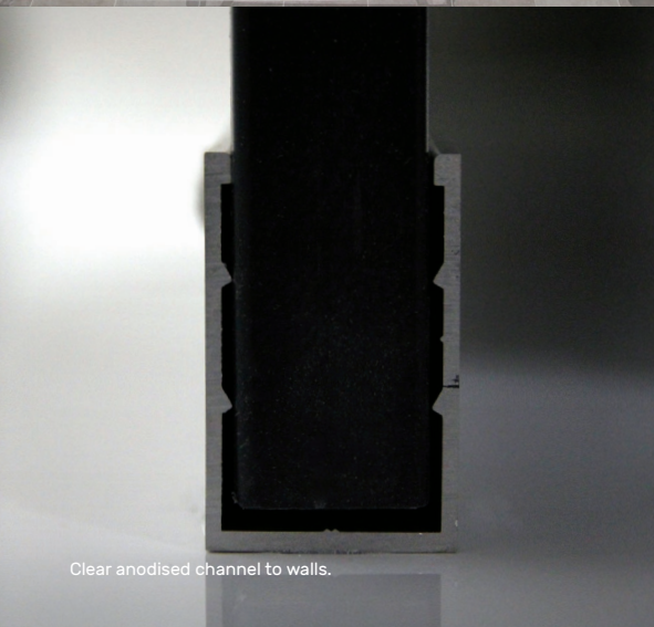
Clear anodised channel to walls.

At TPI we have developed unique detailing and features specific for use in education facilities. These products enable safety, security, emergency access, and reduced maintenance.