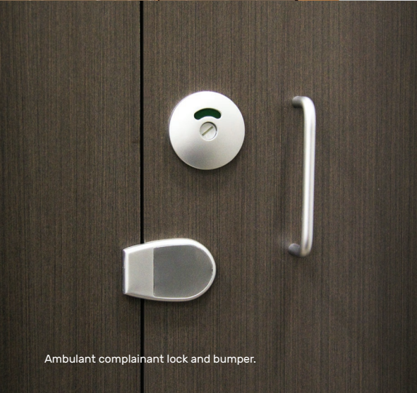
Ambulant complainant lock and bumper.