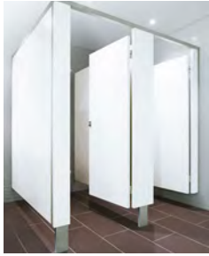
(BO) Blade Mounted Overhead Braced