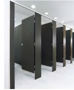
(FO) Floor Mounted Overhead Braced