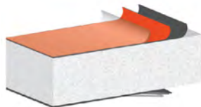
33mm Laminated pre-finished board on HMR substrate