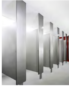
(BC) Blade Mounted Ceiling Fixed