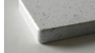
19mm Nuvex Saniboard (Only available in PO & FO systems)