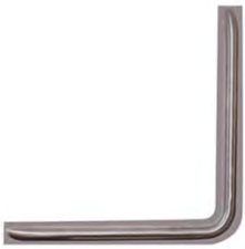
Grab-rails MLR 112