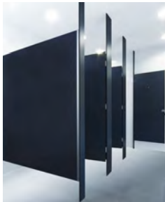
(FC) Floor Mounted Ceiling fixed