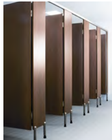
(PO) Pedestal Mounted Overhead Braced