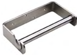
Toilet roll holders ML113SS