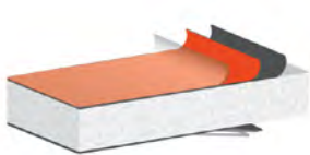
18mm Laminated pre-finished board on HMR substrate