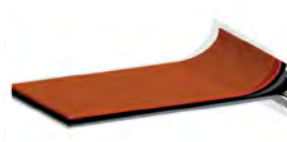
13mm Compact Laminate waterproof